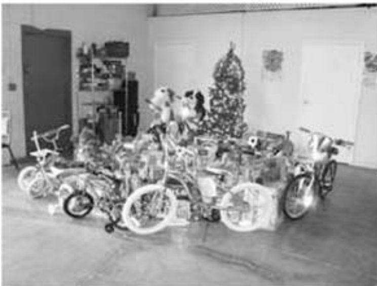
>>> lots of Toys !!!

This awesome event was held on Sunday December 13, after some pretty wet weather that day was sunny and beautiful! We had classic car people show up in their hot rods and if they were not comfortable with driving on damp roads that did not stop them they drove their daily cars. Once again Santa showed up with 4 bikes, but this year it had a twist..... We had a contest to see which hot rodder could put the bike together the quickest.. the winner was Rich ( good job).