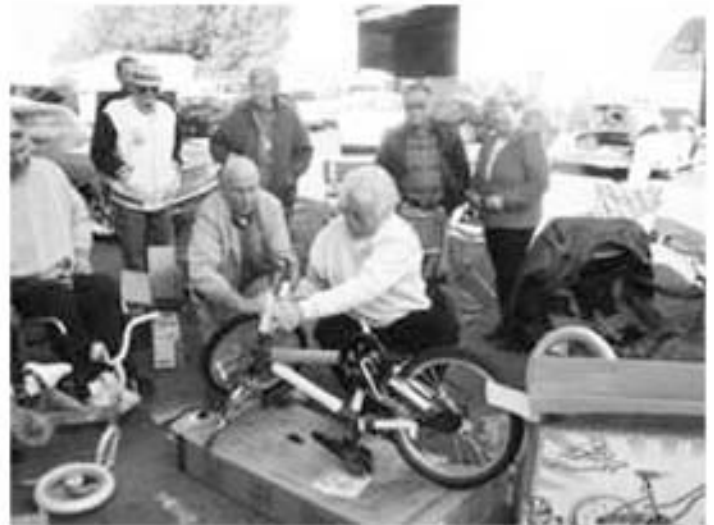
>>> the bicycle assembly area ...