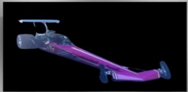
Featuring The 1977 World Champion Top Fuel Dragster